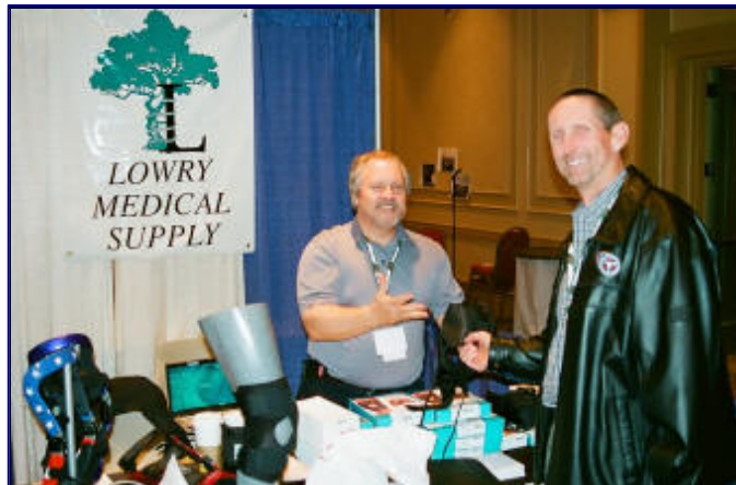
Attendees visit the Lowry Medical Supply Exhibit