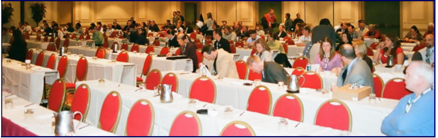
Attendees gather prior to an educational session

Home Site Map News Executive Board Committees State Links Awards Meetings & Education Organization Info Links