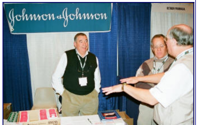
Attendees discuss Johnson & Johnson products