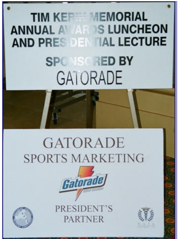
SEATA is grateful to Gatorade for their sponsorship of the Tim Kerin Memorial Annual Awards Luncheon

Home Site Map News Executive Board Committees State Links Awards Meetings & Education Organization Info Links