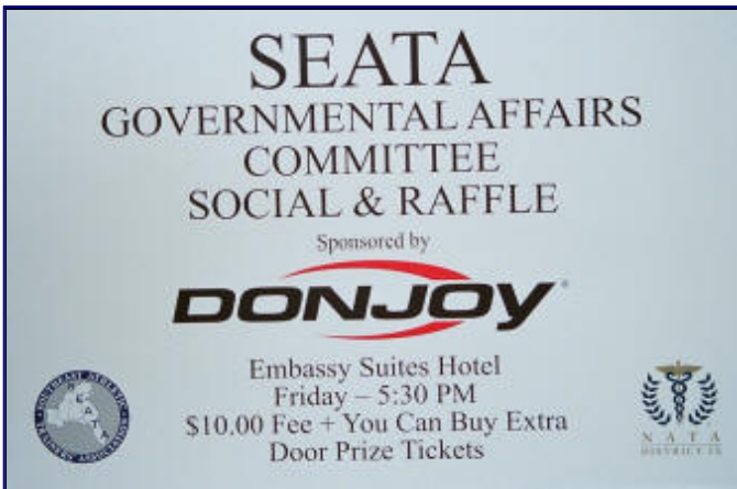
SEATA appreciates the sponsorship of Donjoy for the Governmental Affairs Committee Social