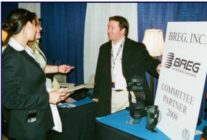
Attendees visit the Breg Exhibit